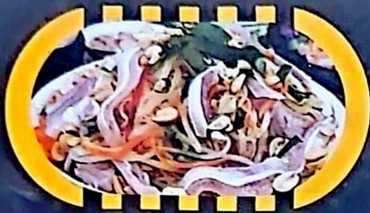
豚の耳サラダ Vietnamese pig ear salad. ¥1.600