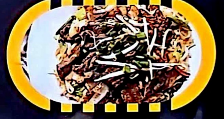
牛肉炒め麺 Stir - fried noodles with beef ¥1.600