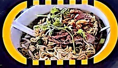
インスタントヌードル Noodles ¥1.150