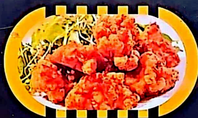
唐揚げ Chicken fried ¥1.250