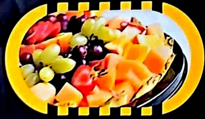
フルーツ盛り合わせ Mix Fruit ¥1.800