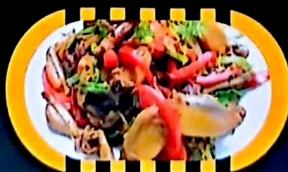
カエルのレモングラスチリ炒め Stir-fried frog with lemongrass and chili ¥1,690