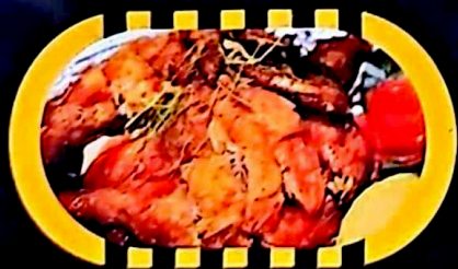
チリ塩焼き鶏 Roasted chicken with chili salt ¥1,800