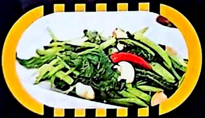
小松菜のニンニク炒め Stir-fried sweet radish with garlic ¥1.250