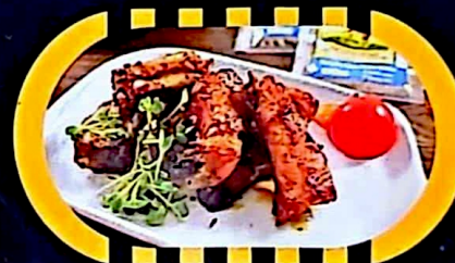
チリ塩焼きスペアリブ Grilled ribs with salt and chili ¥1,800