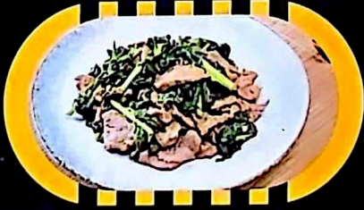
牛肉のニンニク炒め Stir-fried beef with cabbage ¥1.500