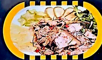
レア豚肉のレモン味 Wild boar with lemon ¥2,100