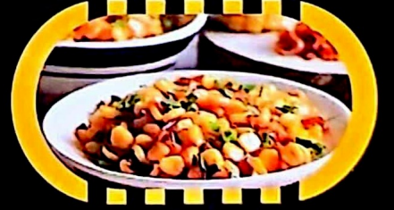
干しエビとコーン炒め Stir-fried corn with dried shrimp ¥1.400