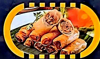
揚げ春巻き Spring rolls ¥1.190