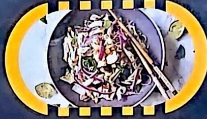
ベトナム風チキンサラダ Vietnamese shredded chicken salad. ¥1.700