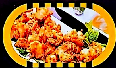
なんこつ唐揚げ(塩) Fried chicken cartilage with salt ¥1.600