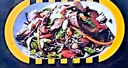
ベトナム風ビーフサラダ Vietnamese Beef salad ¥1.800