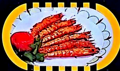
チリ塩焼きエビ Grilled shrimp with salt and chili ¥1,700