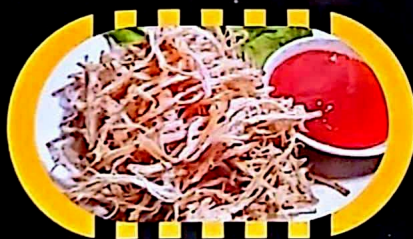
干しイカ焼き Grilled dried squid ¥1.400