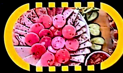
発酵ソーセージと肉ハム Vietnamese fermented pork roll ¥1,500