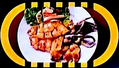
イカ焼きサテトム Roasted squid with chilli paste ¥1450