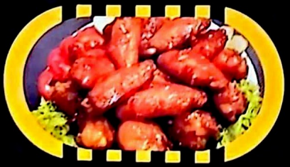
手羽先唐揚ヌオックナム風味 Fried chicken wing sauce ¥1.500