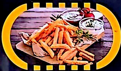
フライポテト French fries ¥1.130