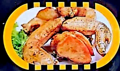
手羽先のチーズ唐揚げ Butter-fried chicken wings ¥1,500