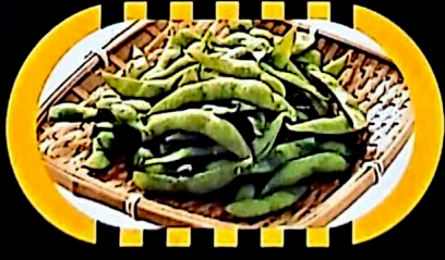
枝豆 Japanese green soybeans ¥1.100