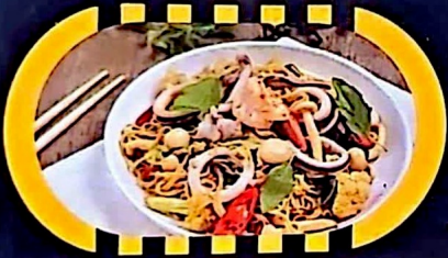
海鮮炒め麺 Stir - fried noodles with seafood ¥1.600