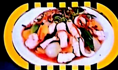
甘酸っぱいイカ Sweet and sour Calamari ¥1,390