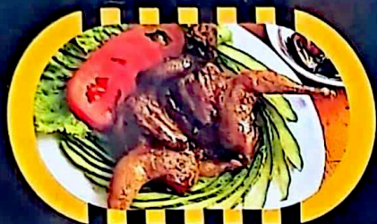
うずらのロースト Roasted quail ¥2,000