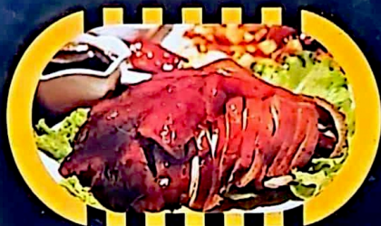
カモ丸焼き Roasted duck ¥1,900